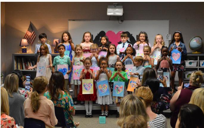
Mother's Day Program

Additionally, students attend Physical Education every day.