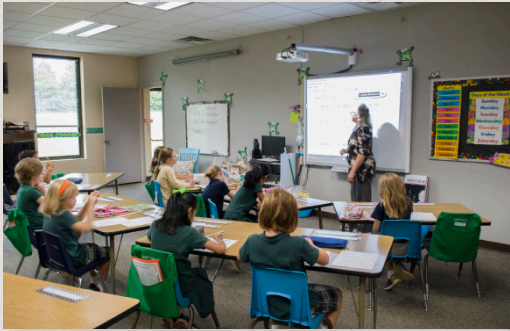
Small Class Sizes ~ Math